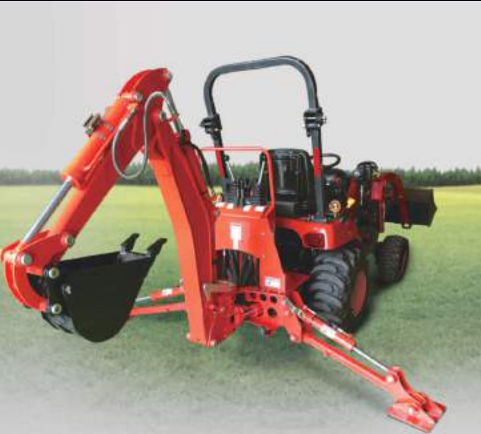
Backhoe Model : SB2410 Tractor Model : CS2610