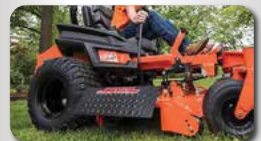
ADVANCED CHUTE SYSTEM