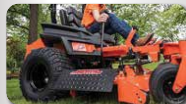
ADVANCED CHUTE SYSTEM