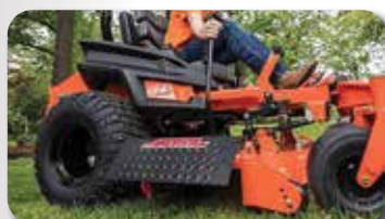
ADVANCED CHUTE SYSTEM