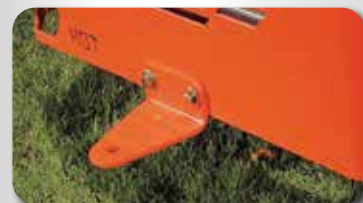
BOLT ON HITCH