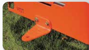
BOLT ON HITCH