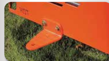
BOLT ON HITCH