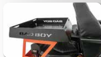
REAR MOUNT BASKET