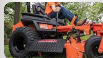
ADVANCED CHUTE SYSTEM