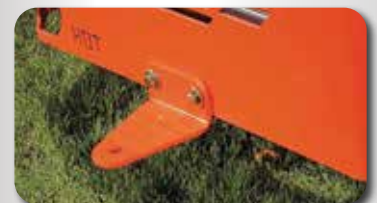
BOLT ON HITCH