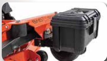
FRONT MOUNT TOOL BOX