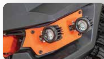
LED TANK LIGHT KIT