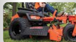
ADVANCED CHUTE SYSTEM