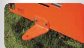
BOLT ON HITCH